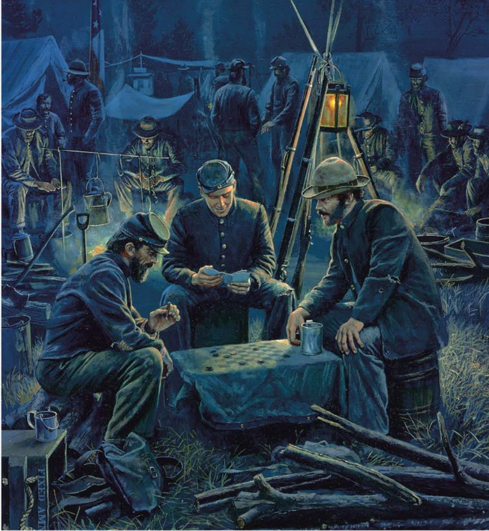
Letter from Home , Mort Künstler. © Mort Künstler, Inc. www.mkunstler.com.